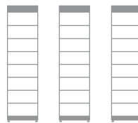
3 x HVM 22.1